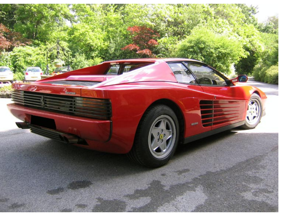
The air-intake above is what gives the Testarossa its wide body and classic look. It was not until the F512 M that the rear grille became less prevalent in exchange for round lamps.

the car's clean appearance. Once the door is open you will see that the cockpit is very low, the door sill is wide and requires some finess to enter/egress smoothly. Once you are seated the visibility is quite good, even to the rear which is unusual for a midengined sportscar. The seats have the usual adjustments to suit most people unless you are taller than 6'4'', at which point headroom becomes scarce. The steering wheel is adjustable up and down, but does not have a telescoping feature. The driving position is classic Italian where long arms and short legs are a plus. A twist of the key, a "whirring" of the starter and the boxer twelve fires up and settles to a purring idle of about 1000